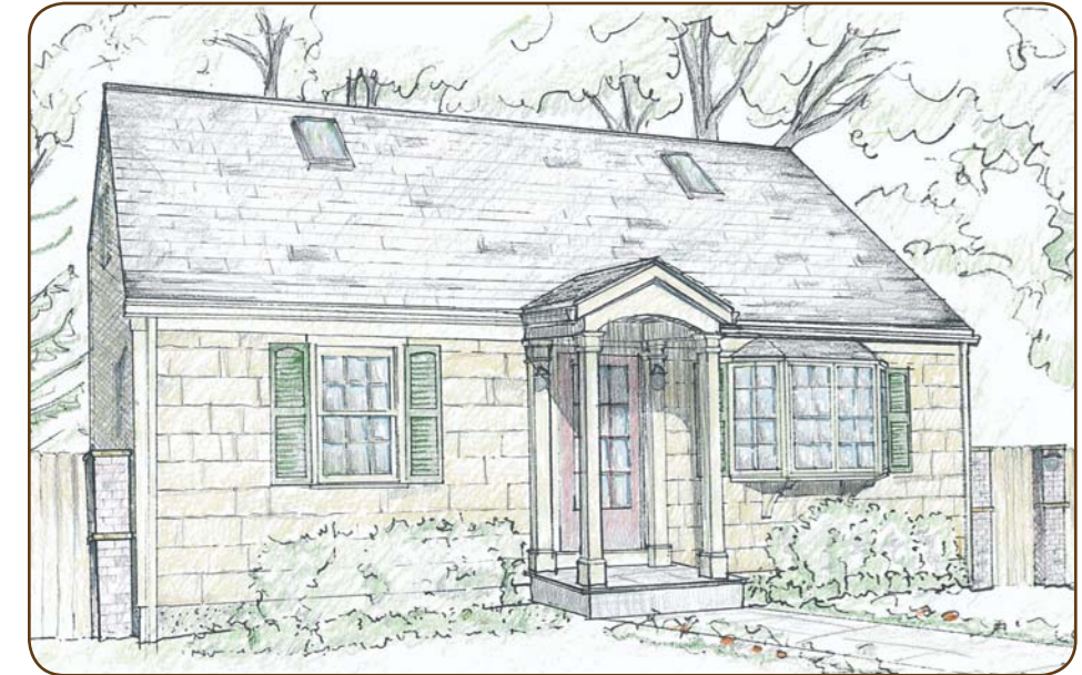
This expanded Cape has a renovated Master Suite with large bathroom and attached dressing room with storage. The first floor has a newly-renovated eat-in kitchen that opens to a deck, and two bedrooms with full bathroom. The home has a large fenced backyard with a garden shed.