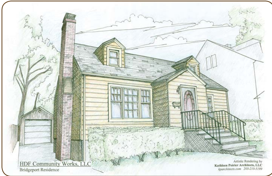
This three bedroom Cape is located in the North End of Bridgeport and features a new kitchen, two renovated bedrooms, and a spacious living room with fireplace. It also has a dining room and hardwood floors throughout. An attached garage is located at the side of the house adjacent to a private fenced backyard.