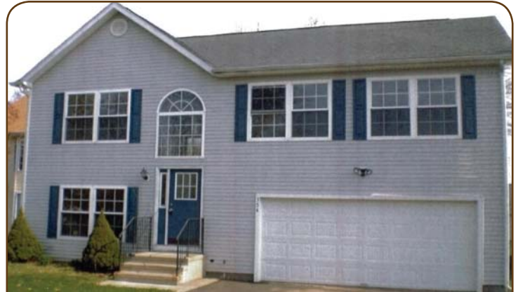
354 Lynne Place, Bridgeport

Visit http://johnkleps.wpsir.com for more information.