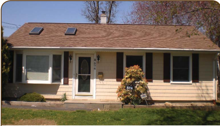
574 Birmingham Street, Bridgeport

Two homes now listed for sale; six others are under construction and will be ready for sale in July